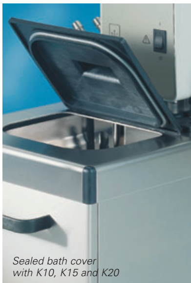
Sealed bath cover with K10, K15 and K20

Choose the necessary tubes, bath liquids and Pt-100 sensor for DC50-units on pages 30/31/33.