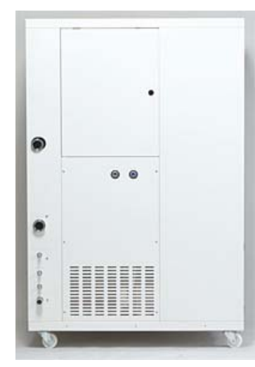
Rear of GAS410