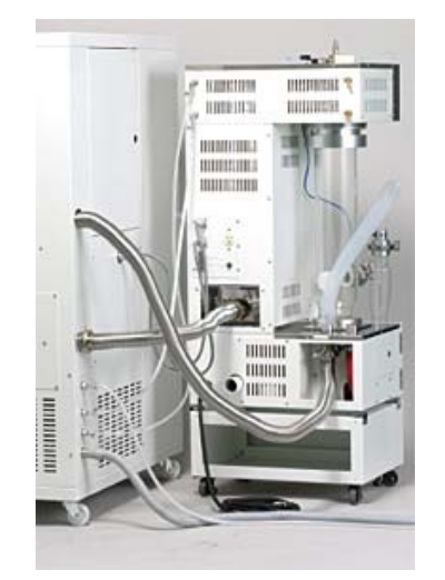
ADL311S-A + GAS410 + stand with caster wheels