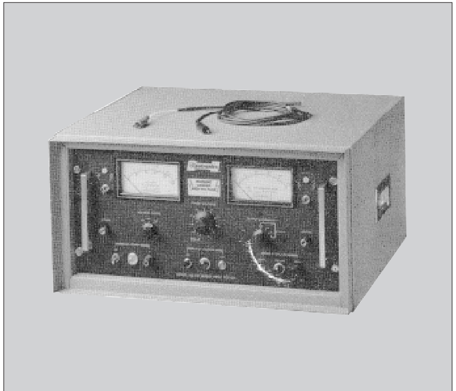
Model HD125 AC/DC Hipot Tester